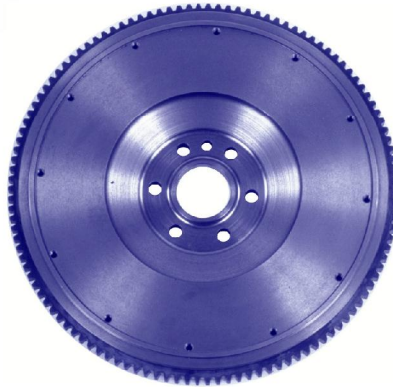
MACK FWN530GB3145BM Style: FLAT Application: E-7 Clutch: 15" – 9 spring disc Bearing: #306 10" bore, 6 mounting holes, 1 dowel hole timing mark, metric bolt holes 20" ring gear with 118 teeth List Price $436.39