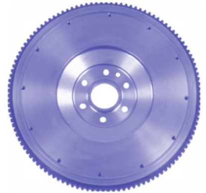
MACK FWN530GB3170 Style: FLAT Application: E-7 E-Tech Series Clutch: 15" – 9 spring disc Bearing: #306 10" bore, 6 mounting holes, 1 dowel hole timing mark, metric bolt holes 20" ring gear with 117 teeth (2 notched teeth) List Price $581.38