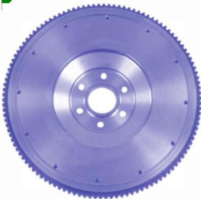
MACK FWN530GB3142 Style: FLAT Application: 675 / 676 Clutch: 15" – 9 spring disc Bearing: #306 10" bore, 6 mounting holes 20" ring gear with 118 teeth List Price $487.10