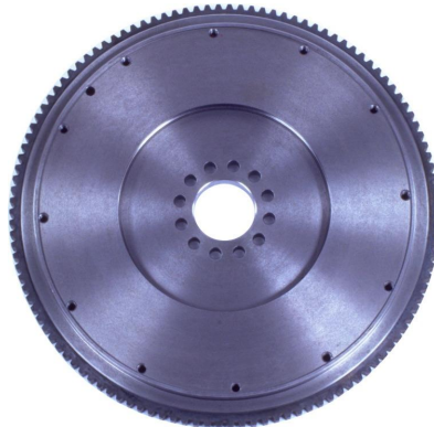
DETROIT FWN23509709 Style: FLAT Application: Series 60 Clutch: 15+ . 7 or 10 spring disc Bearing: #306 10+bore, 12 mounting holes 20+ring gear with 118 teeth List Price $539.75