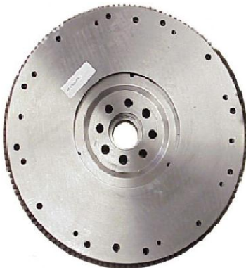
FORD FWNE7HZ6375A Style: FLAT Application: 6.6L / 7.8L Clutch: 14+ . 8 spring disc Bearing: #206 / 305 7.125+bore, 8 mounting holes 17+ring gear with 138 teeth List Price $579.94